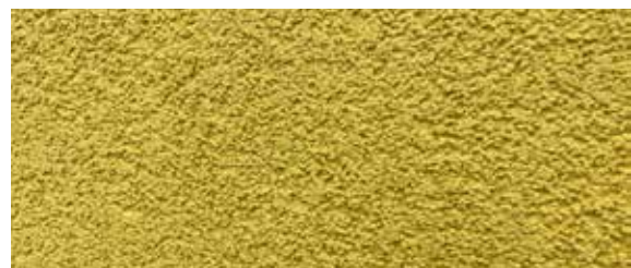
The natural look of the textured characteristics of KEIM Stucasol